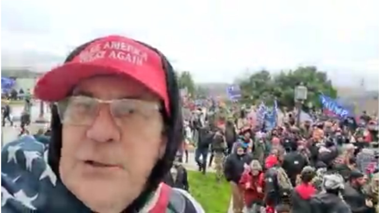
Excerpt of video found in search of Cameron's Facebook records; full video at Exhibit 3

To give you an indication of how important millions of people in the country think election integrity is, civil disobedience has kicked in, and they are doing what they think is right to get attention on the subject. So you can judge, we all can judge, whether this is illegal or not, but if this is what it takes to be heard, because our votes aren't, then this is what happens.